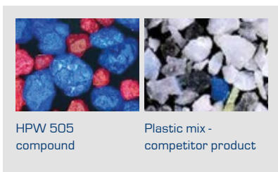
HPW 505 compound

As the market leader in wheel balancing, we are proud to also offer a premium solution for vibration dampening through in-tyre compounds. We are the only manufacturer in Europe offering a full spectrum of heavy-duty knock-on and adhesive weights as well as an own line of vibration dampening products for in-tyre use.