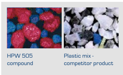
HPW 505 compound

As the market leader in wheel balancing, we are proud to also offer a premium solution for vibration dampening through in-tyre compounds. We are the only manufacturer in Europe offering a full spectrum of heavy-duty knock-on and adhesive weights as well as an own line of vibration dampening products for in-tyre use.